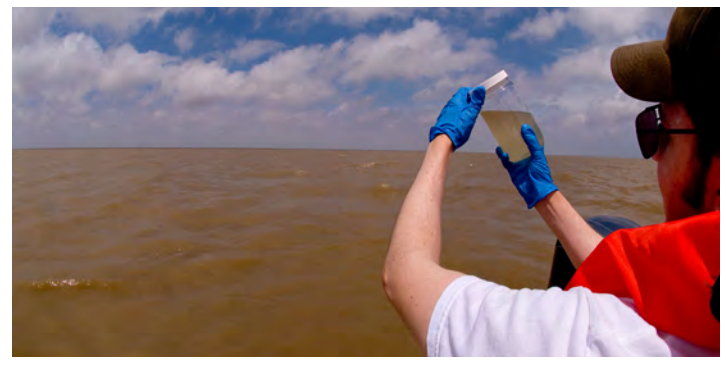
Figure 3. Water sample taken to assess turbidity.

Turbidity is measured directly using a turbidity meter or sensor (nephelometry). Turbidity can also be measured indirectly through water clarity, which is measured in deeper rivers or lakes using a Secchi disk.