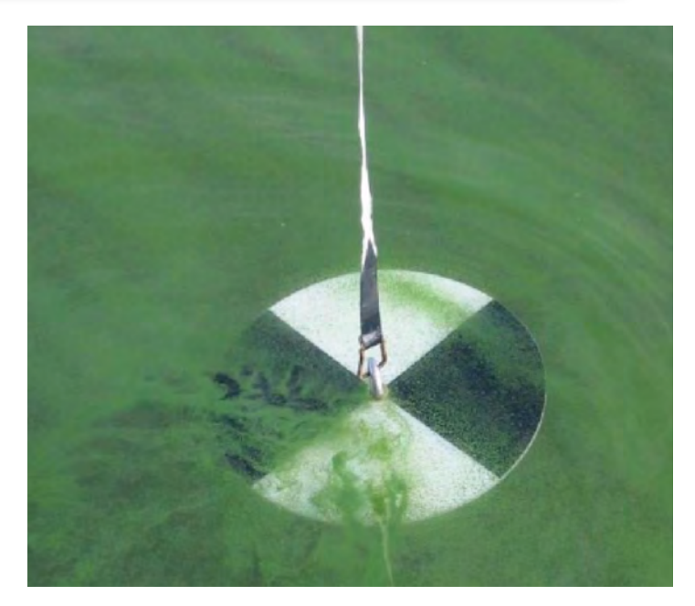
Figure 4. Secchi disk measuring the Secchi depth in water with extensive algal growth.

Turbidity is an optical property of water rather than a chemical or biological measurement. Caution should be exercised when using turbidity as a water quality parameter because high turbidity levels do not necessarily indicate poor water quality, and low turbidity levels do not necessarily indicate good water quality. Values should, therefore, be evaluated alongside other parameters. Measurements made using a Secchi disk as shown in Figure 4 are qualitative and subject to the accuracy of the measurer. A related parameter, total suspended solids (TSS), is the concentration of particles suspended in the water column that are larger than two microns in size. Although turbidity is not a direct measure of TSS, changes in turbidity often correspond with changes in TSS. In general, higher turbidity values and greater TSS concentrations are both observed at higher flows. TSS is reported in units of mg/L.