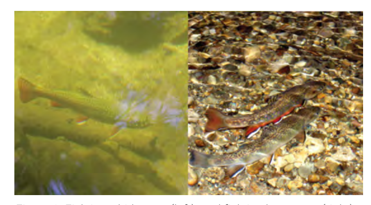
Figure 1. Fish in turbid water (left), and fish in clear water (right).

The suspended solids contributing to turbidity can affect water chemistry and microbiology. The particles can adsorb (take up on their surfaces) pollutants, including nutrients, metals, and organic compounds. If the particles settle on the bottom of the waterbody, then the pollutants settle with them. If bottom sediments are subsequently disturbed and resuspended, the aquatic community can be exposed to any adsorbed toxins or nutrients.