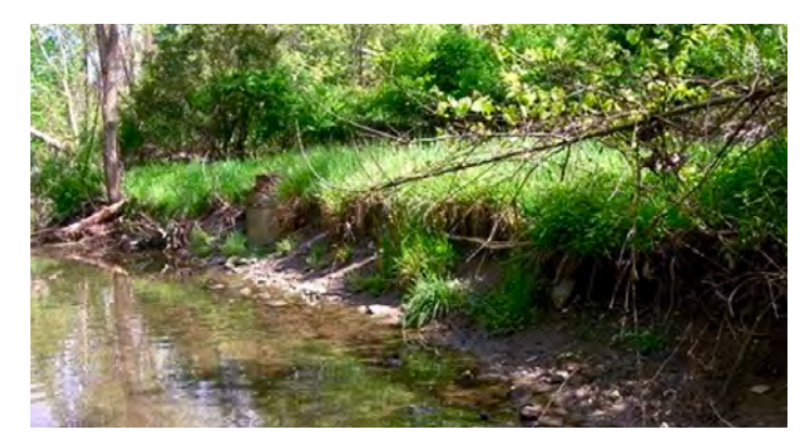
Figure 2. Example of streambank erosion.